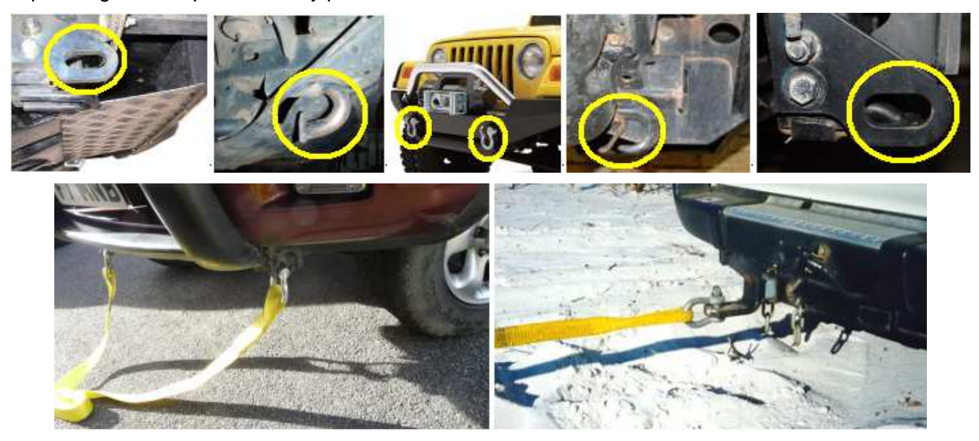
Typical secure front connection

Examples of good and poor recovery points are shown below -